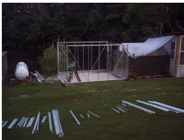
Frame work being installed

will allow for more hanging plants and additional height to